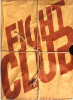
Fight Club DVD

Spoiler warning: Plot and/or ending details follow.