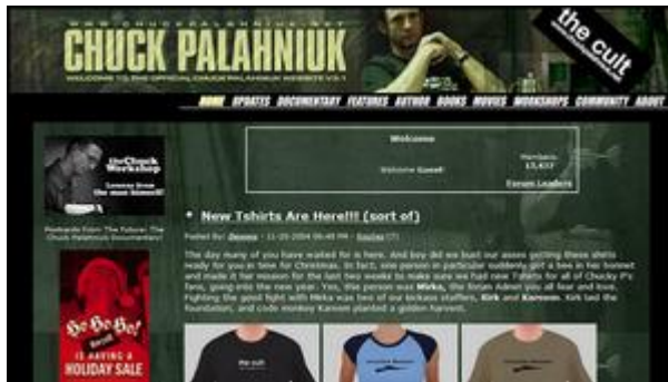
Screenshot of www.chuckalahniuk.net

In 2003, members of Palahniuk's official web site made a documentary film about his life called Postcards from the Future: The Chuck Palahniuk Documentary . The official fan site, "The Cult" as the members call themselves, has initiated a writer's workshop where Chuck Palahniuk himself teaches the tricks of the trade. Every month Palahniuk puts up an essay on one of his writing methods, and answers questions about them later in the month. Palahniuk plans to compile all of these essays into a book on minimalist writing. Palahniuk also tries to answer every piece of fan mail sent to him. He sometimes sends odd gifts (such as plastic severed hands, prom tiaras, and masks) back with his responses. He also often gives these to fans at his book readings, sometimes as prizes for asking him questions. Along with signing fans' books at these readings, he also marks them with