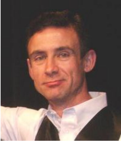
Chuck Palahniuk, February 28, 2006, on the Roses and Shit 2006 tour at the University of British Columbia

Born: February 21, 1962, Pasco, Washington